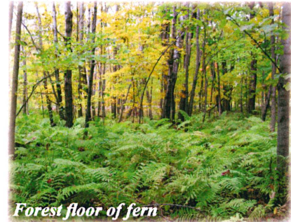
Forest floor of fern

Sugarbush Preserve is a nature preserve, please be respectful during your visit.