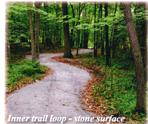
Inner trail loop - stone surface